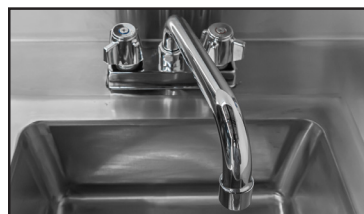
Hot/Cold Water Faucet