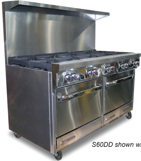
S60DD shown with optional casters