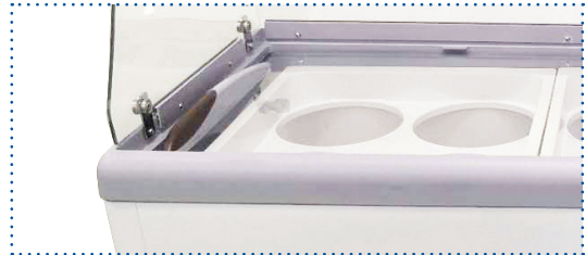
Sliding doors for easy access