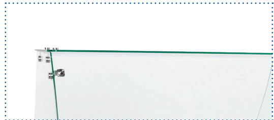
Flat-glass sneeze guard to prevent contamination