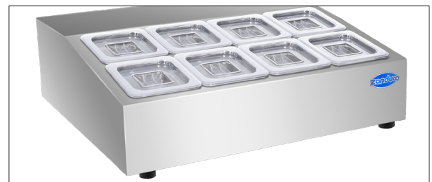
Compact design perfectly suited for countertops or prep tables in limited spaces