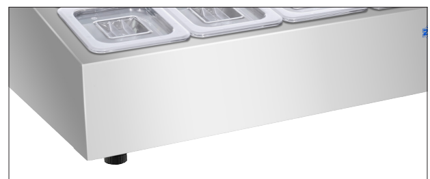
Adjustable non-slip feet ensure easy leveling and provide stability on various surfaces